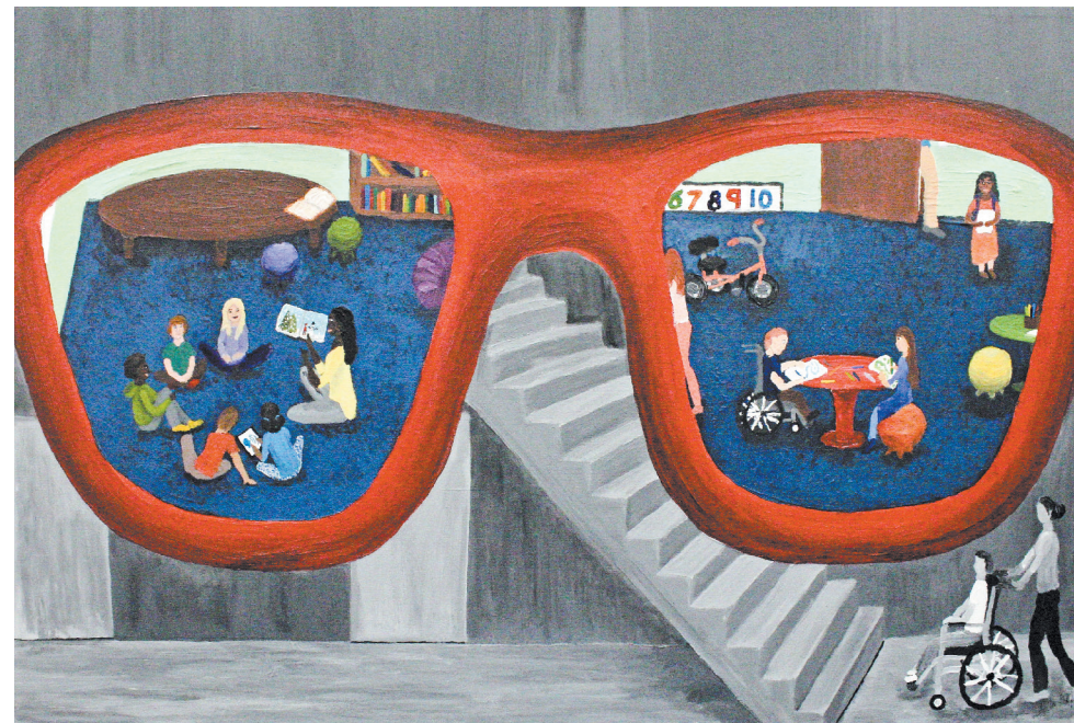
Changing the Way We See, winning artwork from MDDC's 2018 Inclusion Awards